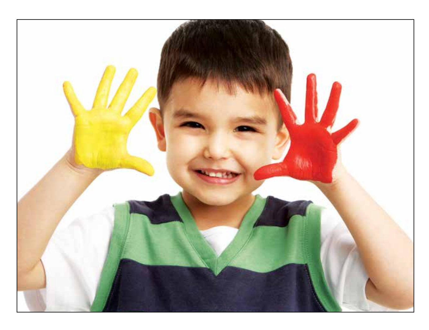
We look forward to having your child in kindergarten. It is our hope that all kindergarten students will have an exciting and productive school year.